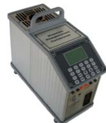
MTC 350 / MTC 650