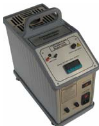
350H / 650H